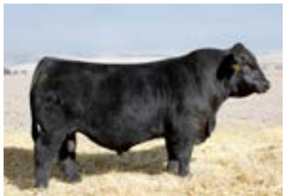
KBHR Honor H060