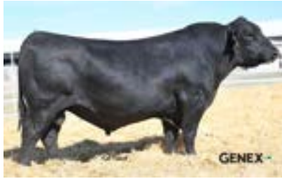
GIBSS 9224G Essential