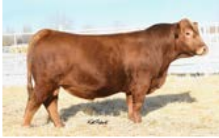
Redhill Burley 99J