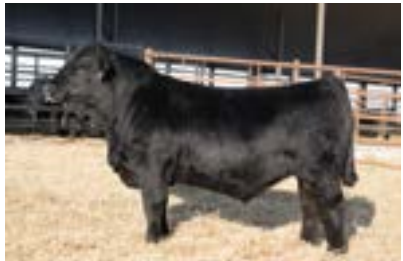
CLRS Johnny Walker 1049J