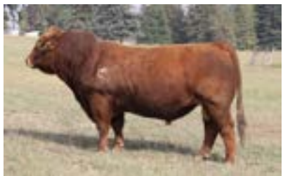
HSF Cardinal 133G